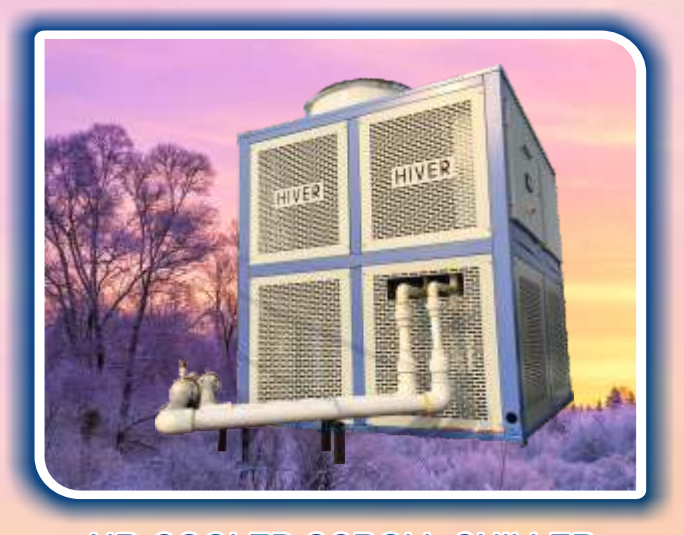
AIR-COOLED SCROLL CHILLER