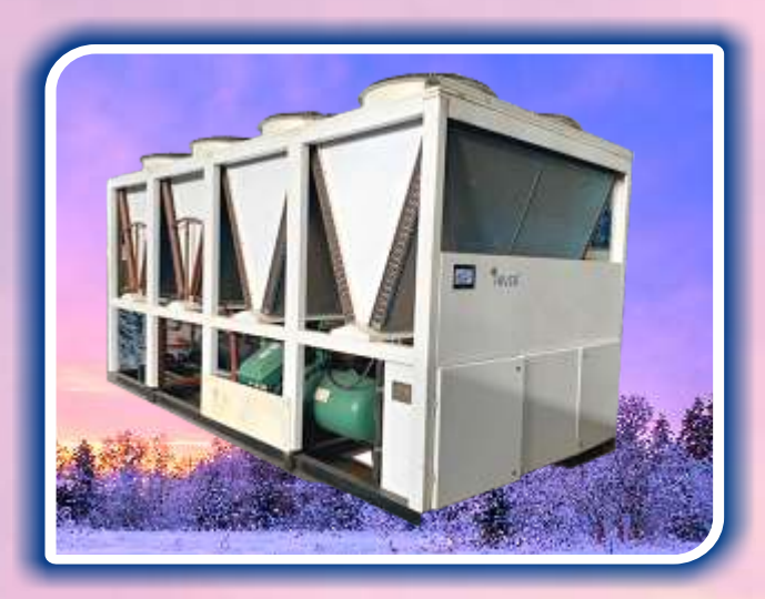
AIR-COOLED SCREW CHILLER