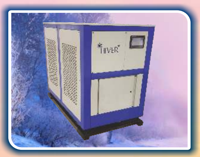
WATER-COOLED SCROLL CHILLER