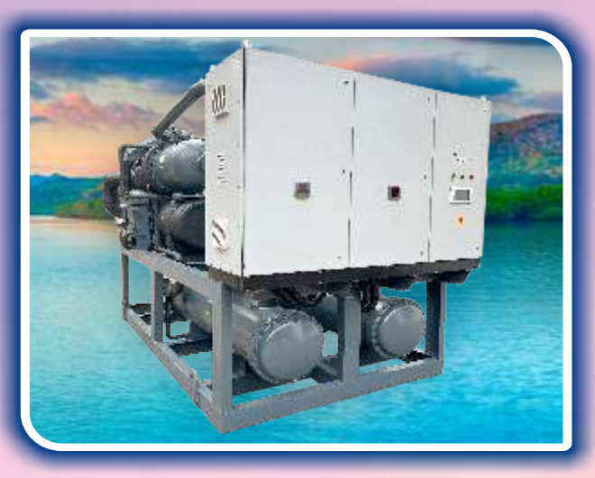
MEG BRINE SCREW CHILLER