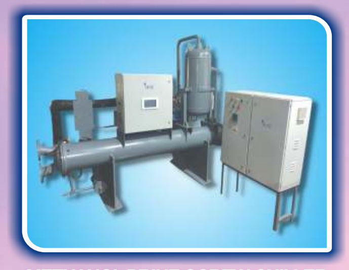
METHANOL BRINE SCREW CHILLER