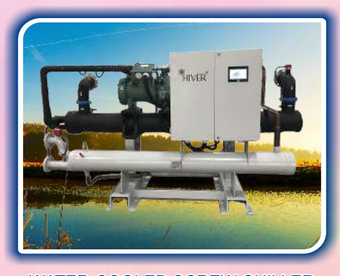
WATER-COOLED SCREW CHILLER